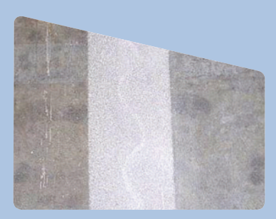
Shot Blast Preparation

This method is a great compromise on price, durability and aesthetics. Simple and quick to install, a good level of durability, a cost effective solution and a full range of colours available.