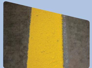
Shot Blasted Finished

Specified by Warehouse Partners for use with: